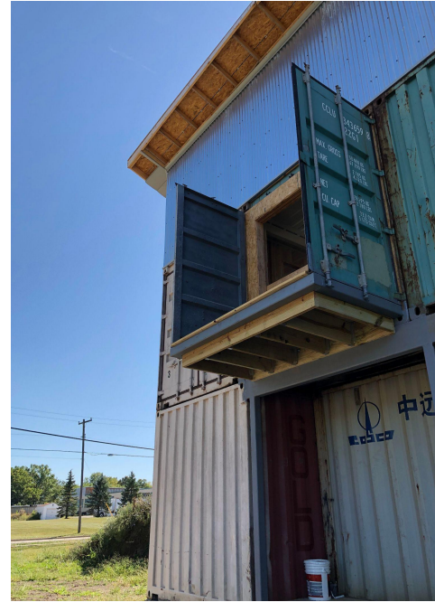
CargoApartments in Construction 2019

Overall we have successfully designed and managed the construction of projects located in Columbus, Portland and NYC covering 15K sq ft and over 2M in budget.