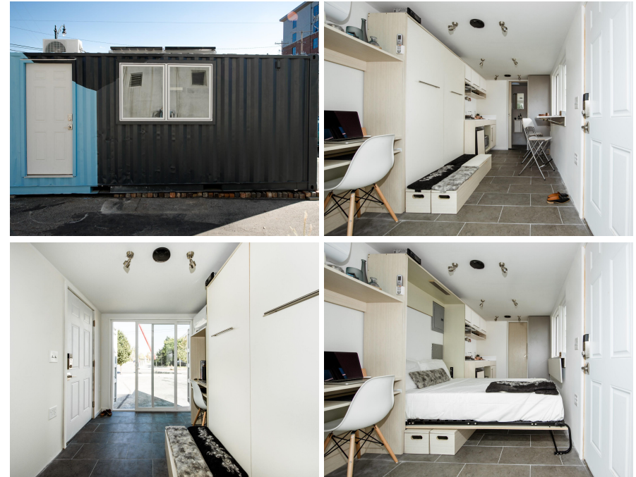
The Calico Home 2017 Cargo Apartments 2018

Upon graduation I had the opportunity to begin work on my first new construction project, the Cargo Apartments in Marysville, Oh.